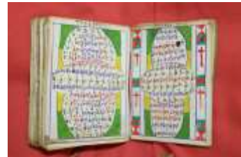
Bamum text

Paper 2 may be assessed either by one three-hour written exam or by coursework essay, depending on the option chosen. For those taking an option assessed by coursework, the essay submission deadline is noon of Tuesday of the 2 nd week of Trinity Term . For those taking an option assessed by written examination, the date of the examination will be in early June.