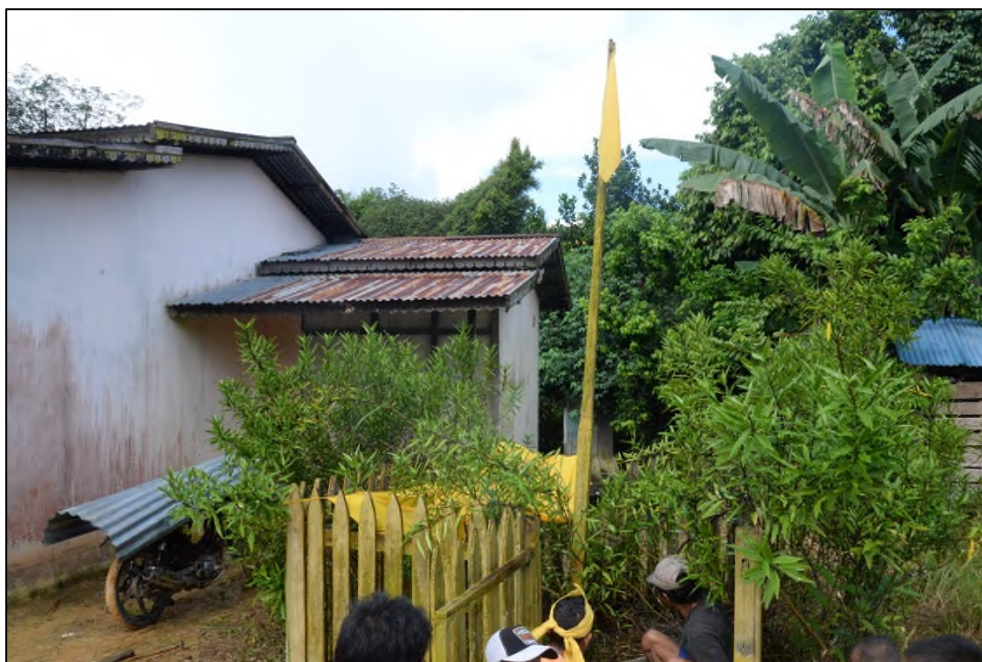
Photo 1. Flagpole planted by the Ulu Ai'